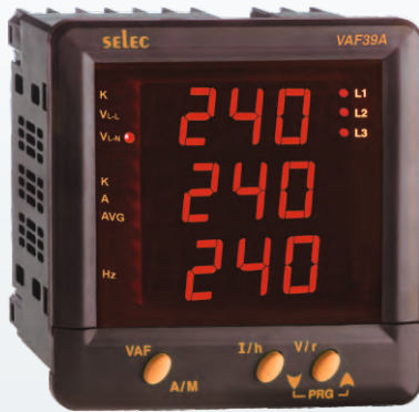
96 X 96mm