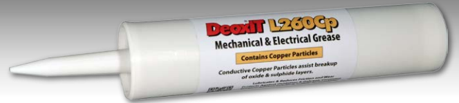
Caulking Tube (226 g)