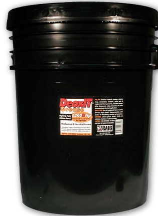
Pail (15.9 KG)