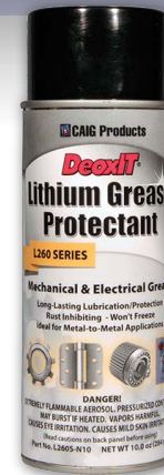
Sprays (10.0 oz / 284 g)