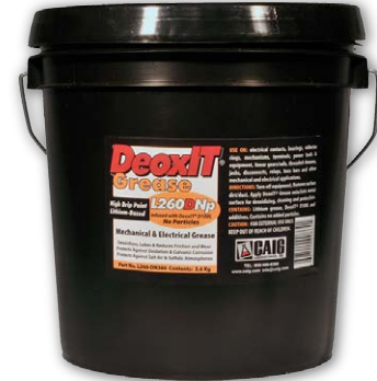
Small Pail (3.6 KG)