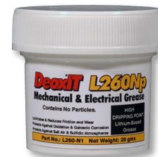
Small Jar (28 g)