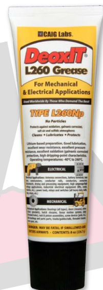
NEW Tube (226 g)