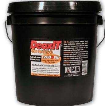
Small Pail (3.6 KG)