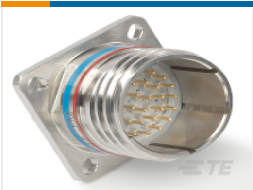
TE Part # CAT-D38999-DTS7S D38999: Square Flange, 25-35 insert