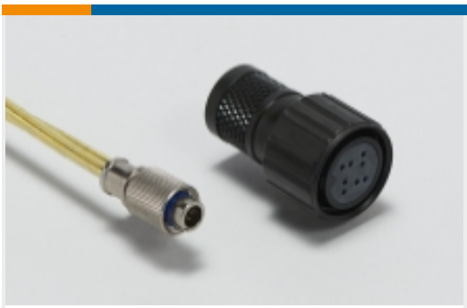
Standard Circular Connectors(9206)