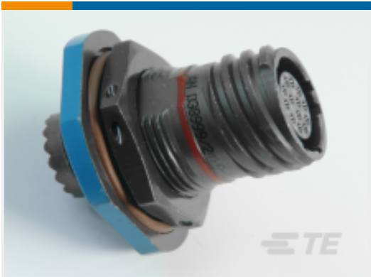
TE Part # CAT-D38999-DTS16G Jam Nut: D38999, 25-35 Insert

This information is provided based on reasonable inquiry of our suppliers and represents our current actual knowledge based on the information they provided. This information is subject to change. The part numbers that TE has identified as EU RoHS compliant have a maximum concentration of 0.1% by weight in homogenous materials for lead, hexavalent chromium, mercury, PBB, PBDE, DBP, BBP, DEHP, DIBP, and 0.01% for cadmium, or qualify for an exemption to these limits as defined in the Annexes of Directive 2011/65/EU (RoHS2). Finished electrical and electronic equipment products will be CE marked as required by Directive 2011/65/EU. Components may not be CE marked. Additionally, the part numbers that TE has identified as EU ELV compliant have a maximum concentration of 0.1% by weight in homogenous materials for lead, hexavalent chromium, and mercury, and 0.01% for cadmium, or qualify for an exemption to these limits as defined in the Annexes of Directive 2000/53/EC (ELV). Regarding the REACH Regulation, the information TE provides on SVHC in articles for this part number is based on the latest European Chemicals Agency (ECHA) 'Guidance on requirements for substances in articles' posted at this URL: https://echa.europa.eu/guidance-documents/guidance-on-reach