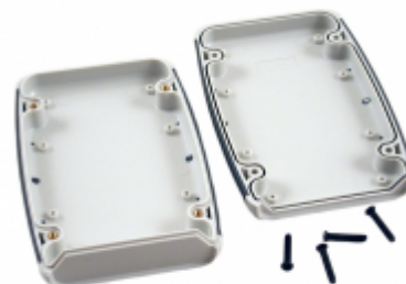
Key Internal Features